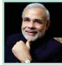
Shri Narendra Modi Hon'ble Prime Minister of India

“Due to the use of washed coal, the energy consumed in transportation, handling and milling, is optimized as the inert material from coal is eliminated. This helps in reducing the auxiliary consumption of equipment involved in coal processing because the use of improved quality coal ultimately results in reduction of emission of GHG as compared to conventional coal.”