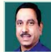
Shri Pralhad Joshi Minister of Parliamentary Affairs, Minister of Coal & Mines

'CONVENIENT ACTION – continuity for Change' by Narendra Modi.